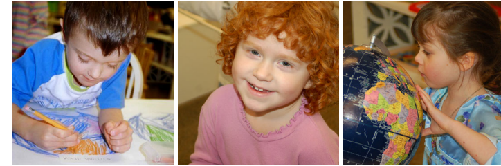
Preschool / Kindergarten

“Establishing peace is the work of education”