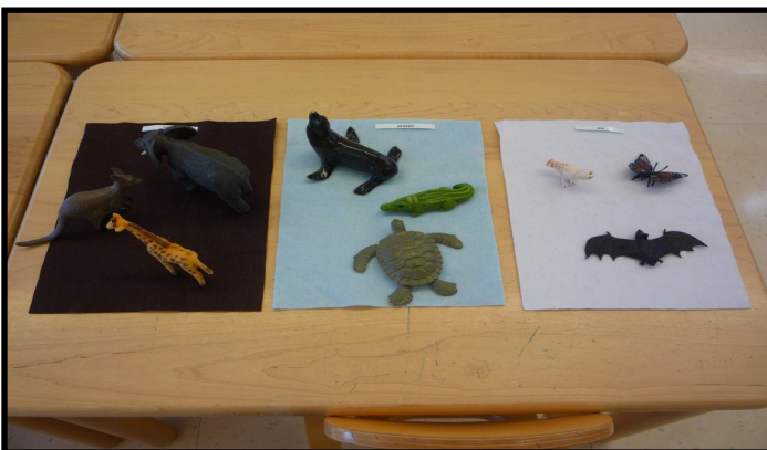
Science; land, air, water in picture above