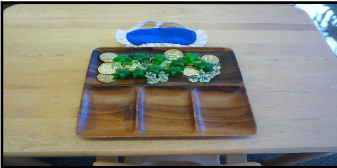
Sensorial; sort objects- color, size, shape