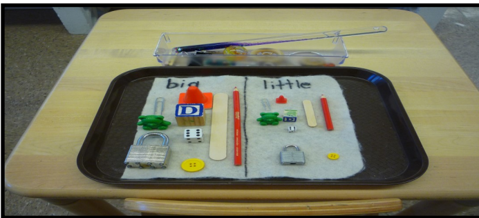
Math; big and little- size, comparison