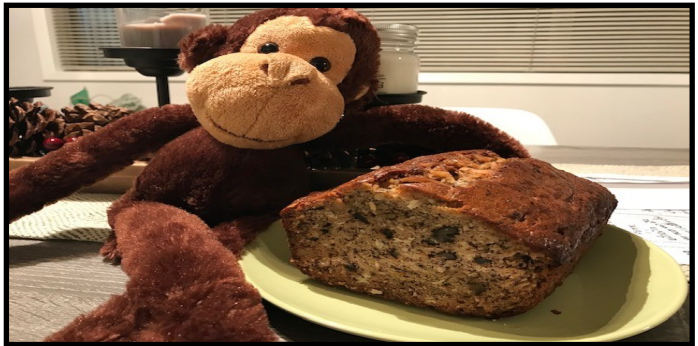
Language; Stuffy vs Monte-directions attached