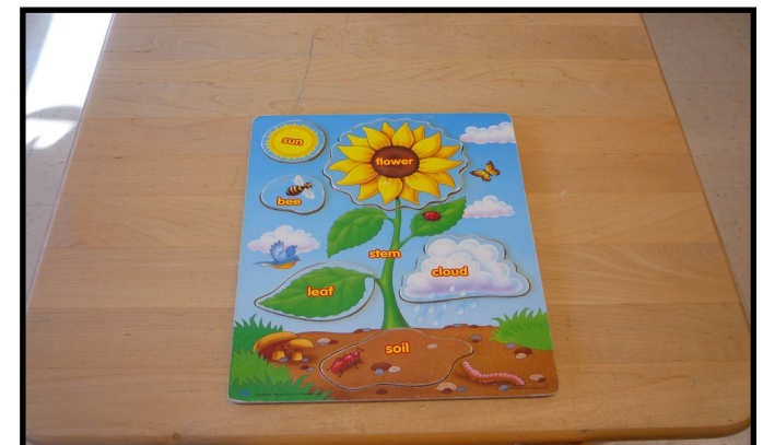
Botany; Parts of a flower; printable attached

Music; 5 little ducks song- see video on our website via Facebook!