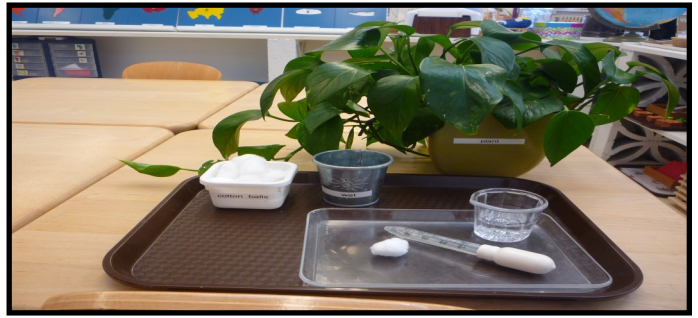
Practical Life; plant washing